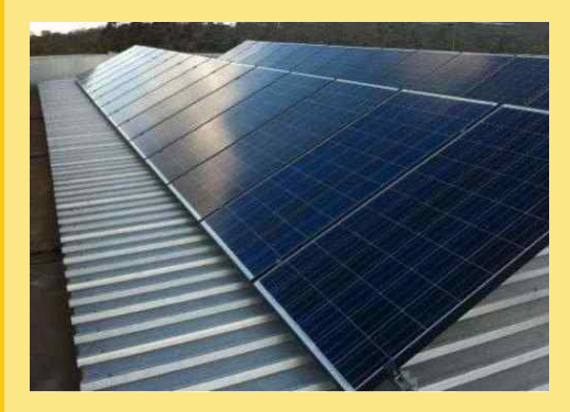
Highfields QLD 7kW system Date of install – September 2014