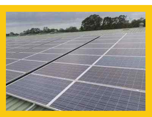
Werombi NSW 100 kW system Date of install – January 2015