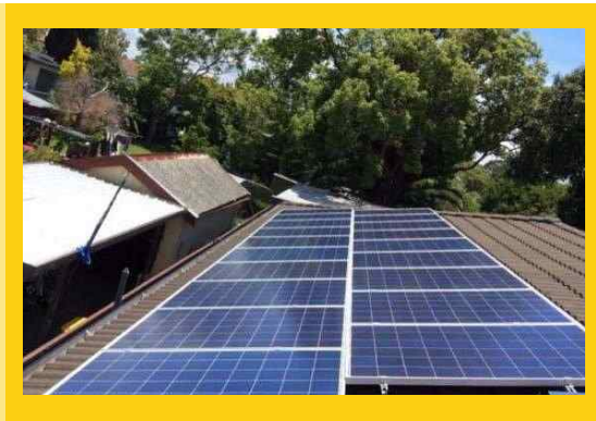
Jannali NSW 4.85kW system January 2015