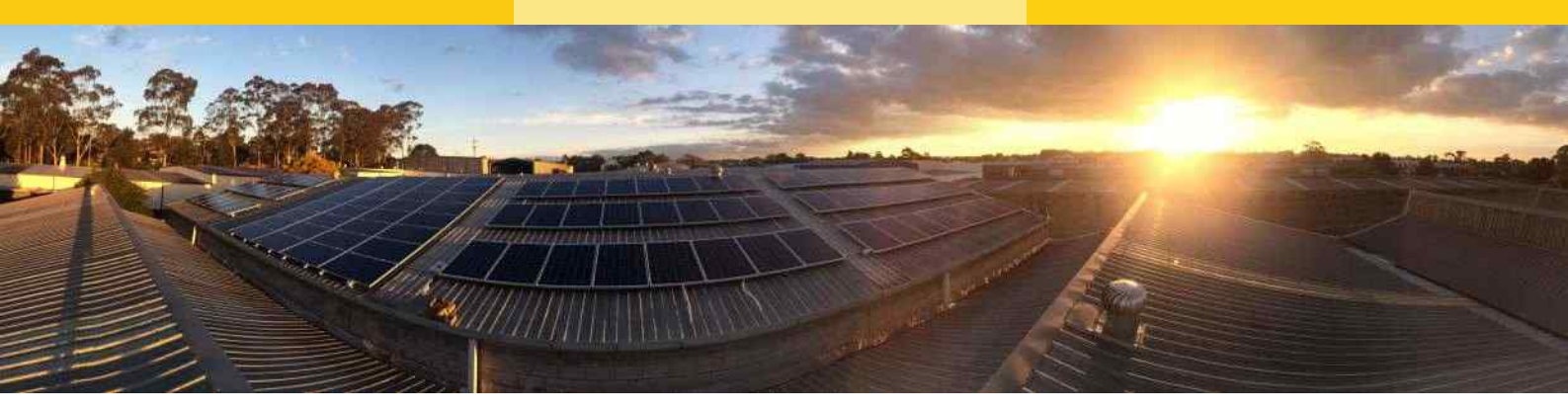
Girraween NSW 25 kW system June 2014